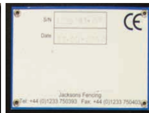
Lockable control cabinet with a CE mark