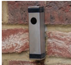
2 pairs of photocells