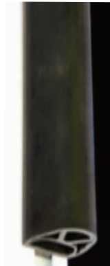
Pressure or safety edges

In addition to interpreting the British Standards guidance, Gate Safe provides further general recommendations to encourage best practice in relation to the installation of automated gates.